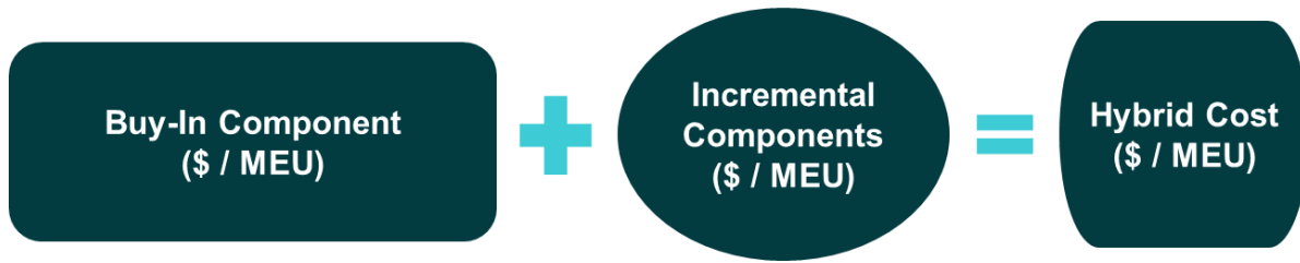
Figure 3: Formula for Hybrid Approach