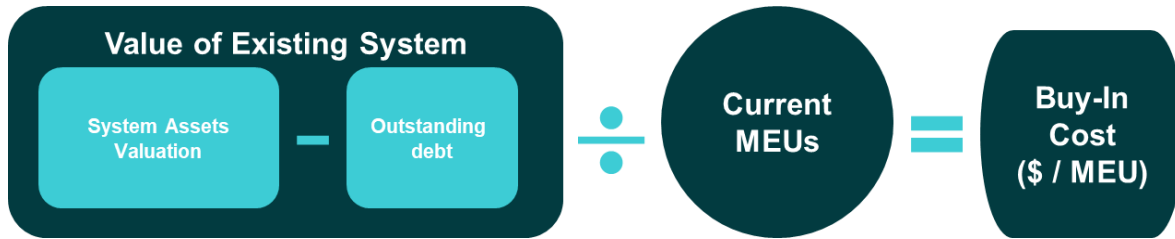
Figure 1: Formula for Buy-In Approach